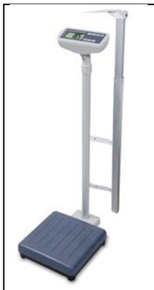
Available With Height Measuring Rod (FA-620U)

1 x 9V [100mA] AC adaptor input (not included)