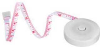
Soft tape 0-150cm