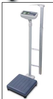
Available With Height Measuring Rod (FA-620U)

1 x 9V [100mA] AC adaptor input (not included)