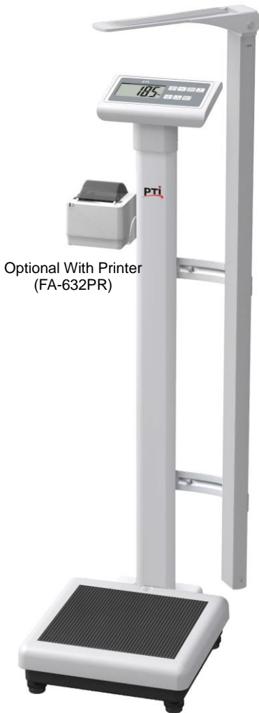
Optional With Printer (FA-632PR)

Height graduation: 0.1cm With RS232 input for printer With USB port input for computer With RJ11 input for height measuring rod With DC jack (DC adaptor not included) With transport castor for users to move around easily Power: 6 X 1.5V AA (not included) / 1 x 9V [500mA] AC adaptor input (not included)