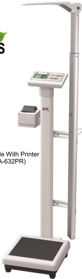
Available With Printer (FA-632PR)