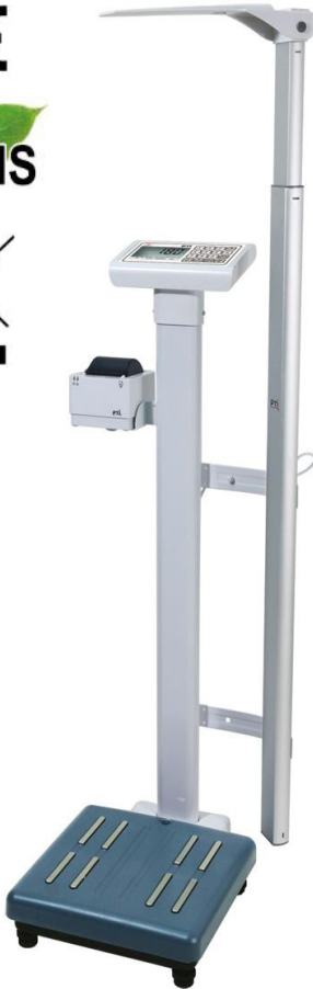
Available With Height Measuring Rod (FA-650U)