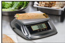
Design for food industry