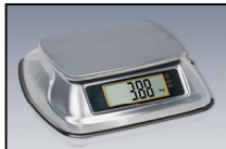
Back display with photosensitive LED backlight

View area size: W90 x H36 mm (3.5"x 1.4")